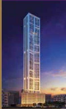
RUPAREL ZION SION CIRCLE MahaRERA No.: P51900014944