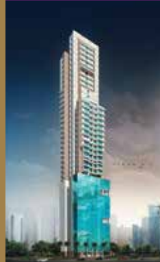
RUPAREL CELESTIA MULUND (E) MahaRERA No.: P51800054935