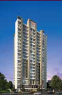
RUPAREL RUPAREL URBANA KURLA (E) MahaRERA No.: P51800077585