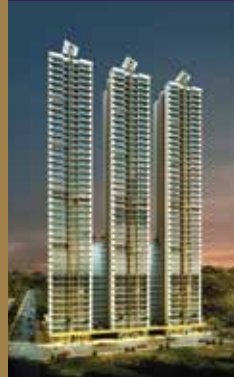
RUPAREL PRISTINE GHATKOPER MahaRERA No.: P51800055522