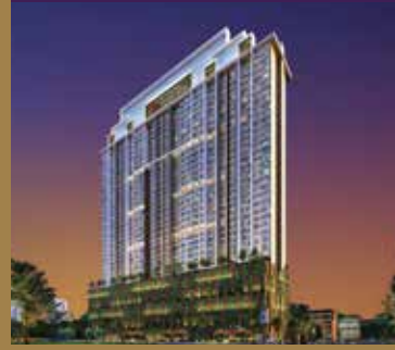
RUPAREL PALACIO KANDIVALI (W) MahaRERA No.: P51800013681