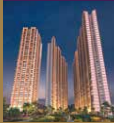
RUPAREL IRIS MATUNGA (W) MahaRERA No.: P51900005988