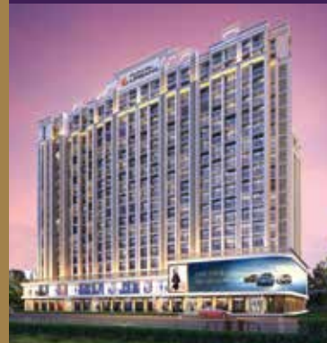
RUPAREL NOVA PAREL MahaRERA No.: P51900019946