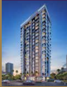
RUPAREL REGALIA SION MahaRERA No.: P51900009359