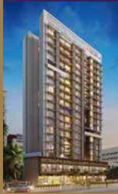
RUPAREL LIVIA KURLA MahaRERA No.: P51800026450