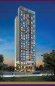
RUPAREL ORION CHEMBUR MahaRERA No.: P51800004525